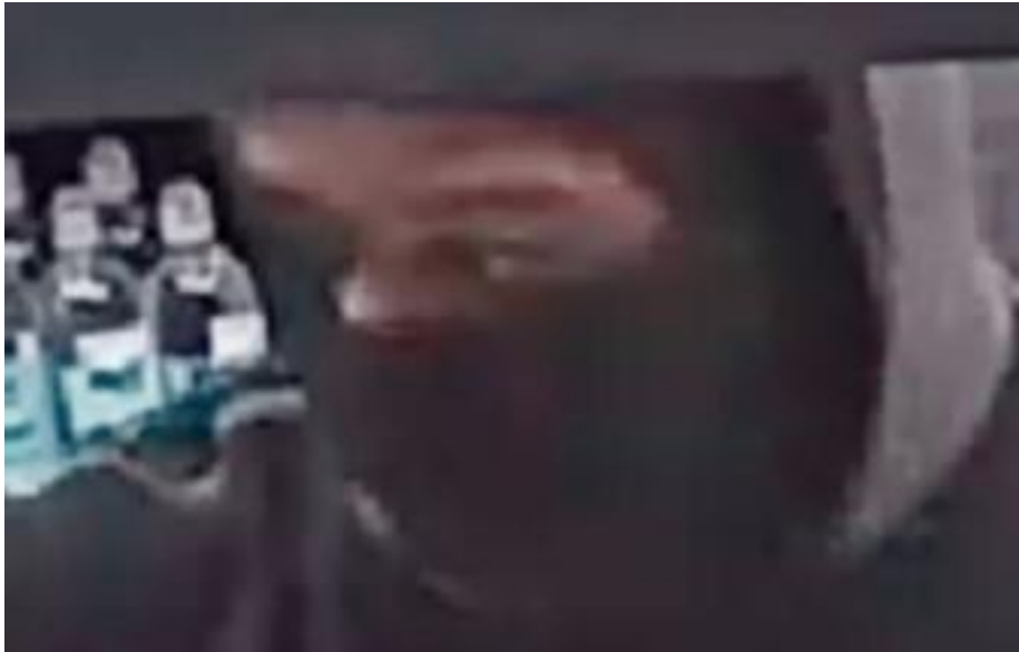
Image of suspect's face from 2/16 incident