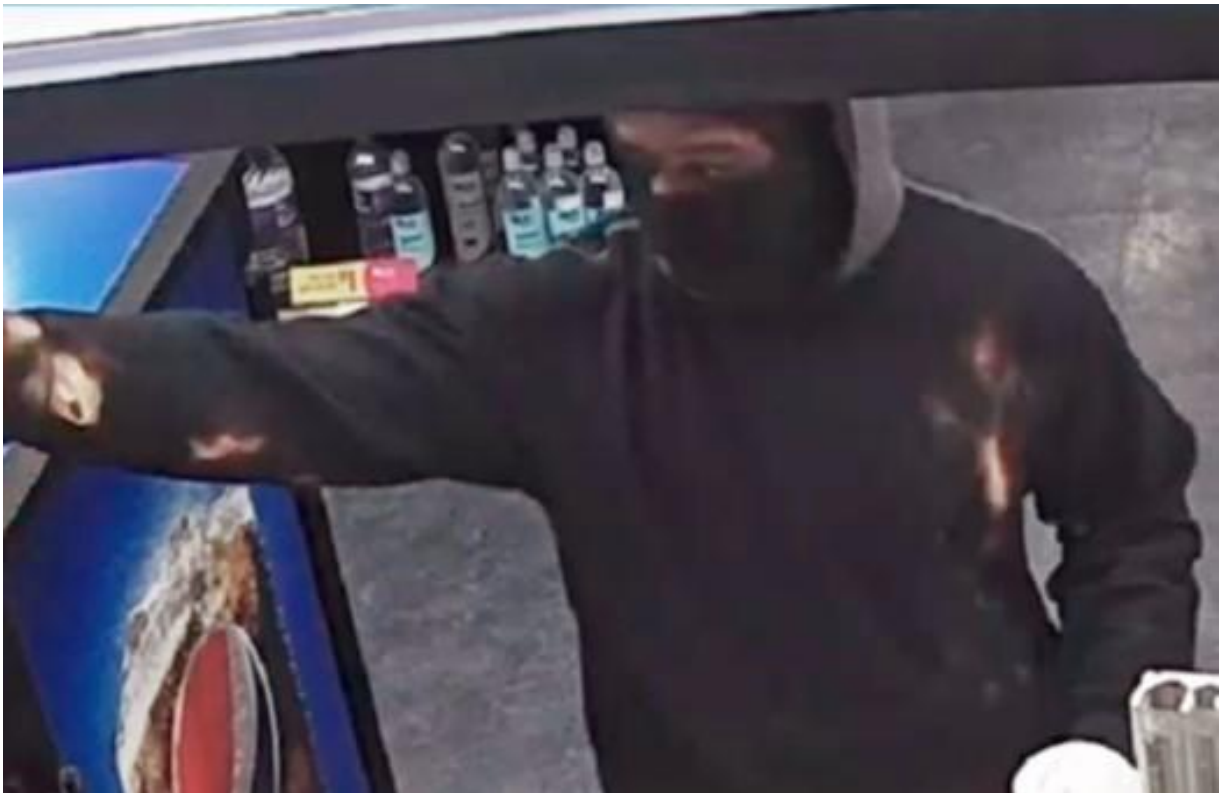
Image of suspect's upper body and face from 2/16 incident